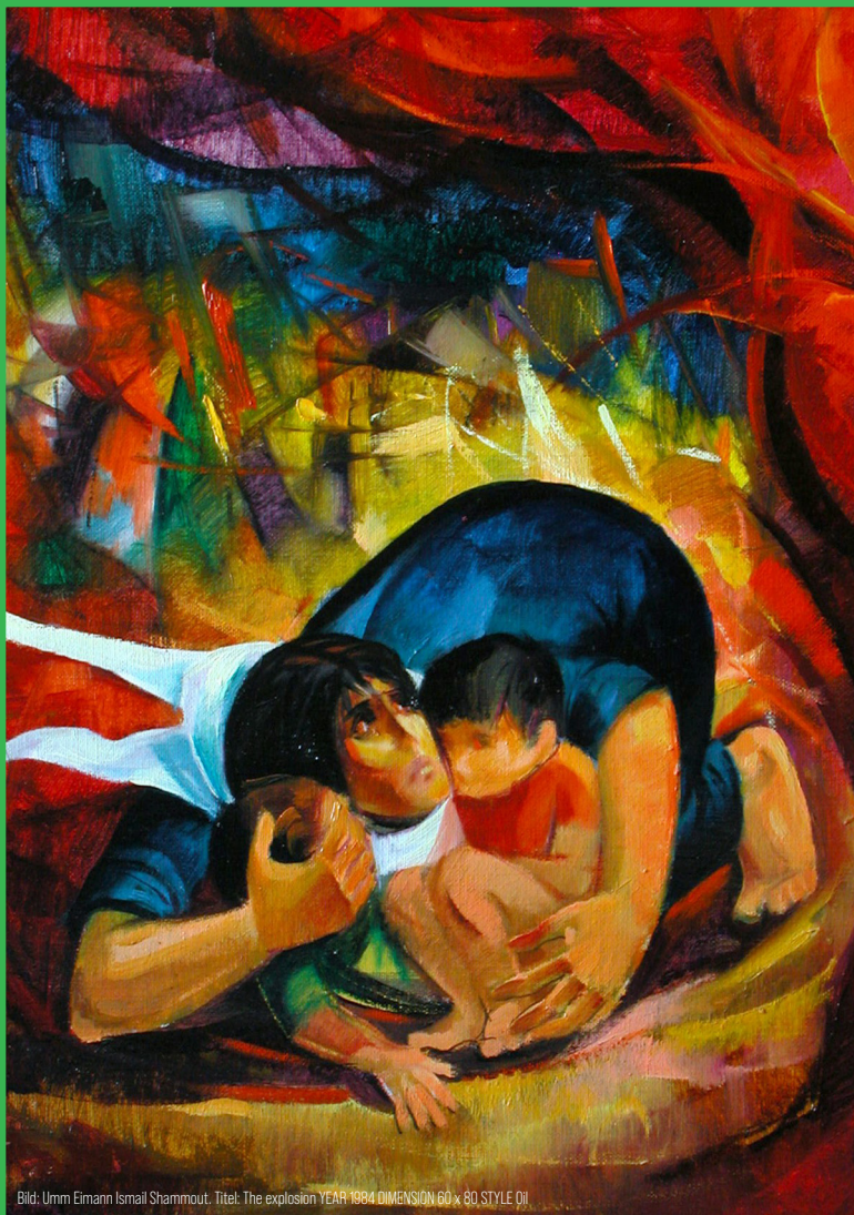
Bild: Umm Eimann Ismail Shammout. Titel: The explosion YEAR: 1984 DIMENSION 60 x 80, STYLE Oil