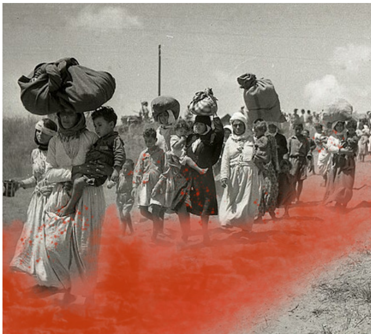
Tantura Expulsion 1948 (Nakba)